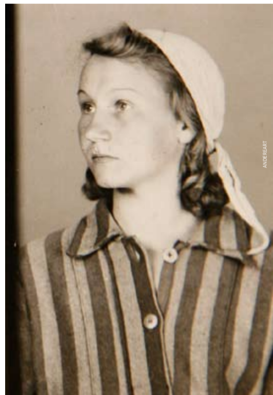
Zofia Posmysz's in Auschwitz