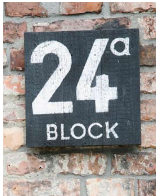
Auschwitz Concentration Camp