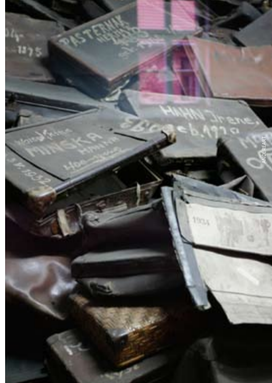
Auschwitz Concentration Camp